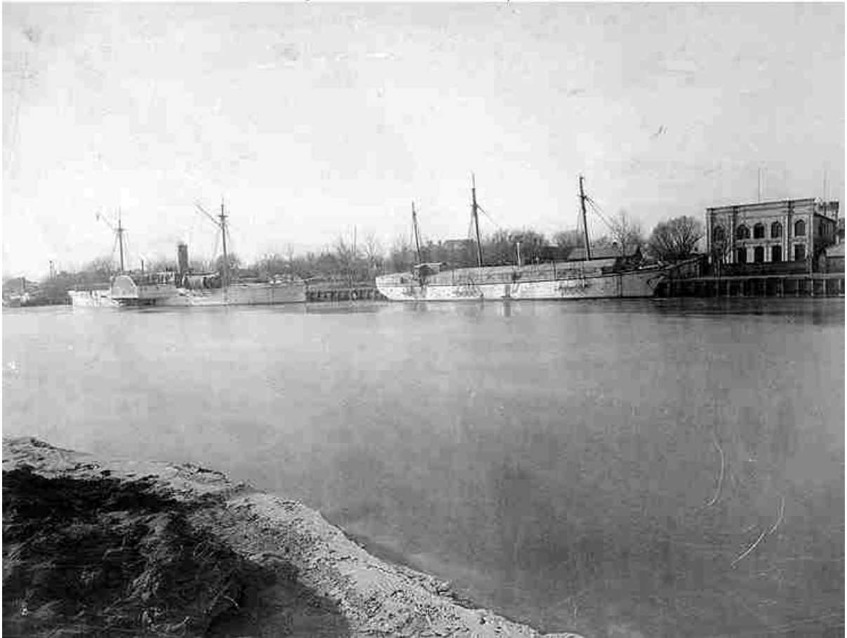
Photo # NH 65784 USS Monocasy and SMS Wolf in winter quarters at Tientsin, China, 1894-95